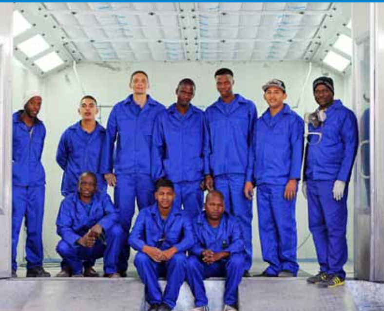
d&p auto body works