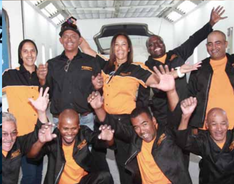
felix's body works