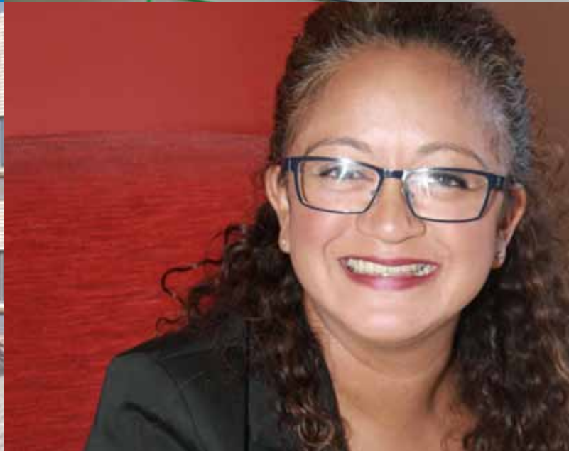
southern cross conferences