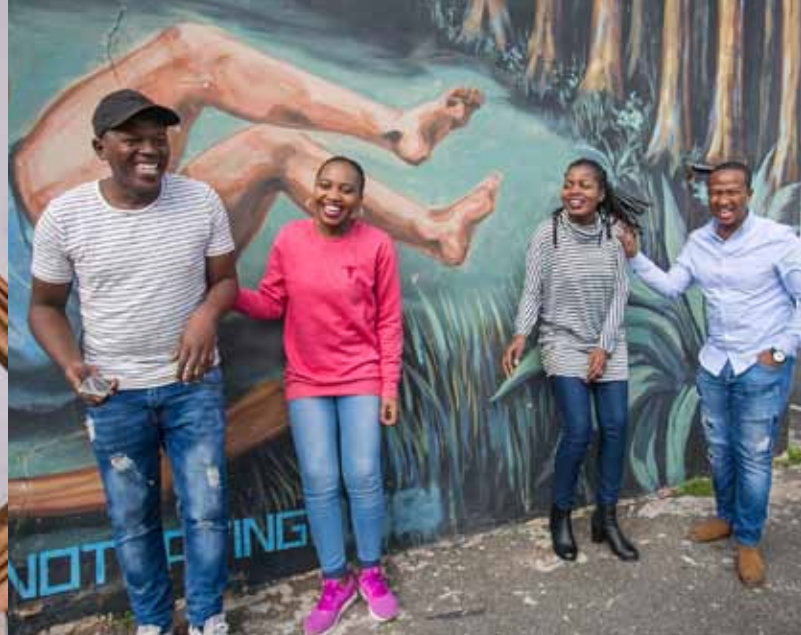
mind trix media