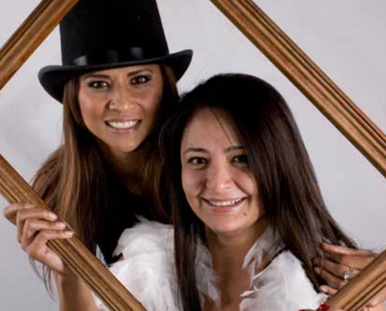
black creative ideas