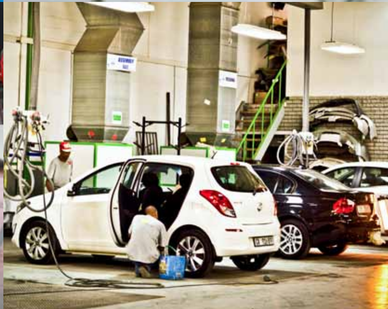
reynolds auto care