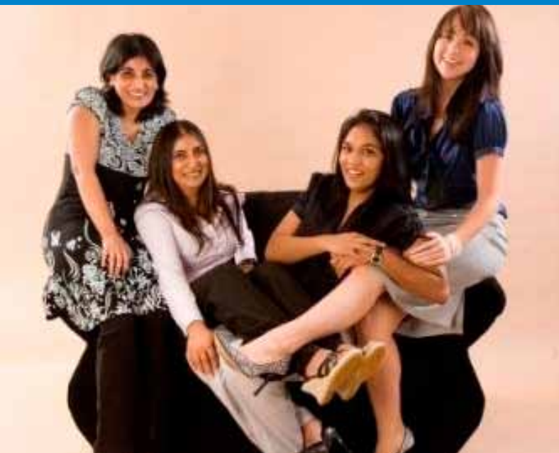
progressive it resourcing