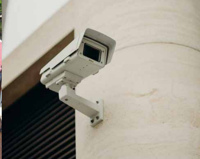
deb group solutions