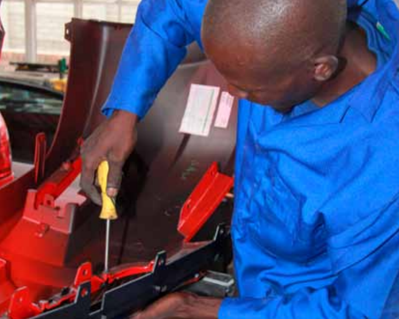
g and t autobody