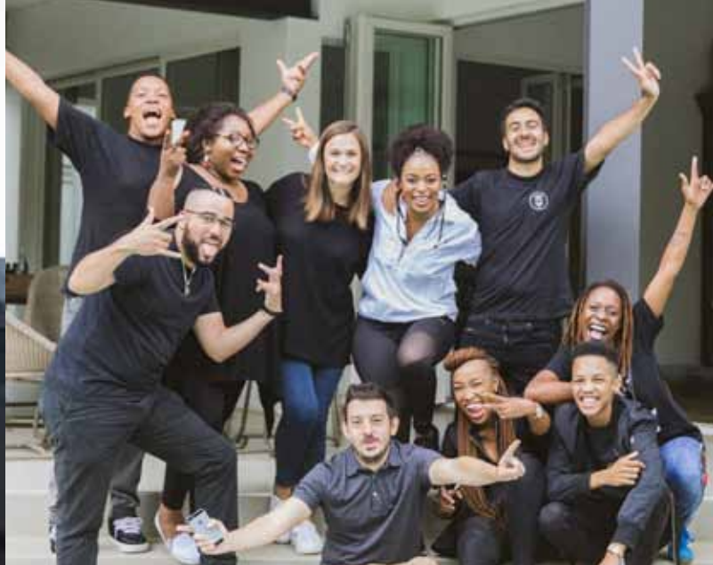
visual content gang